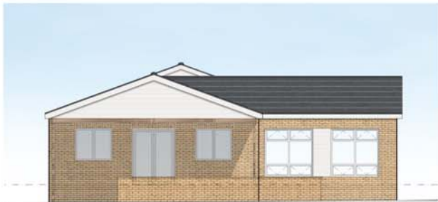
04 PROPOSED NORTH EAST ELEVATION 1:100