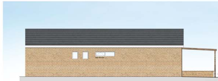
05 PROPOSED SOUTH EAST ELEVATION 1:100

PROJ16/0718 Preliminary Issue to Design Team for review revision/ date note