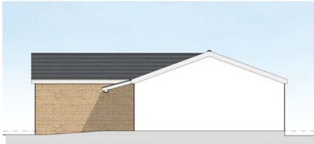
02 PROPOSED SOUTH WEST ELEVATION 1:100