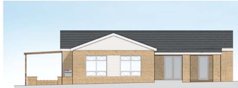
03 PROPOSED NORTH WEST ELEVATION 1:100