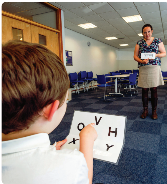
A vision screening test taking place